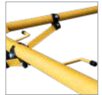
Cable tidy fixture