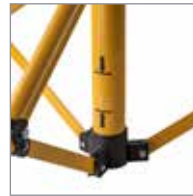
Stability safety feature