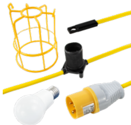
Complete with lamps