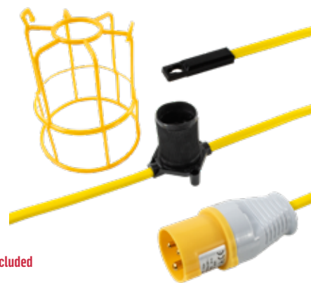
Lamps not included